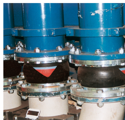
STENFLEX® Type RS-1 used in cooling water system of ship's engine