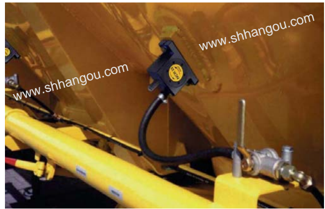
Emptying silo trailers