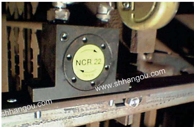
Dusting off filter wires